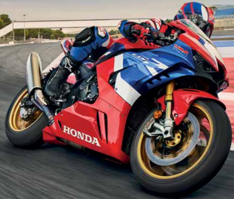
Image shows motorcycle prepared for track use (not available for delivery in this form). Road motorcycle includes indicators, rear view mirrors and number plate.